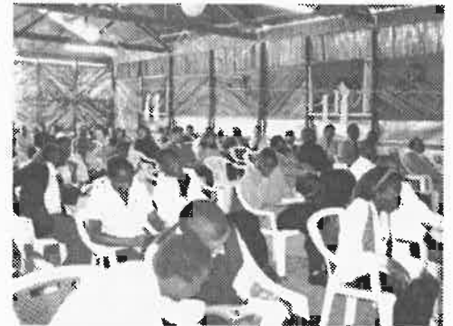
Goal of Nakuru church

Team Leadership - The desire to become a model comes from men and women with